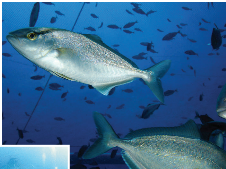
KONA BLUE WATER FARMS

Fishing, which is essentially hunting in the ocean, is a direct or indirect cause of many of these changes — from the loss of large marine mammals to habitat destruction. Incessant hunting, with increasing technological profi-