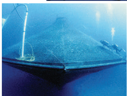
Hemmed in: giant offshore fish pens are currently being developed as a means to harness the sea's resources.

ciency, has decimated fish populations worldwide. Catches of large marine species, such as swordfish and tuna, have declined by 80% over the past 20 years 5 . Northern cod, historically a dietary mainstay, and a species once thought inexhaustible, is all but commercially extinct in the western North Atlantic. In many areas, bottom trawls have scoured the seabed clean. These are just a few examples of the “long and miserable record” of hunting in the ocean 6 .